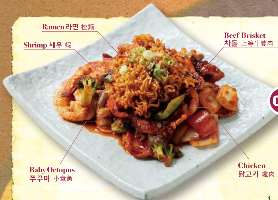
Ramen 라면 拉麵